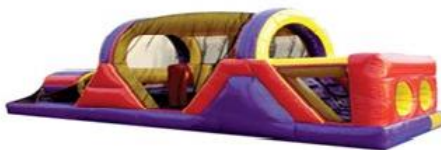
Ninja Jump Obstacle Course